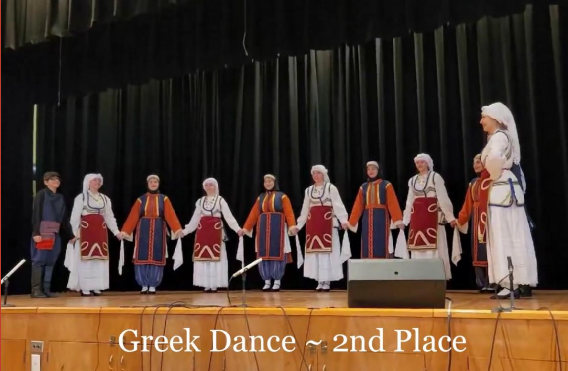
Greek Dance ~ 2nd Place