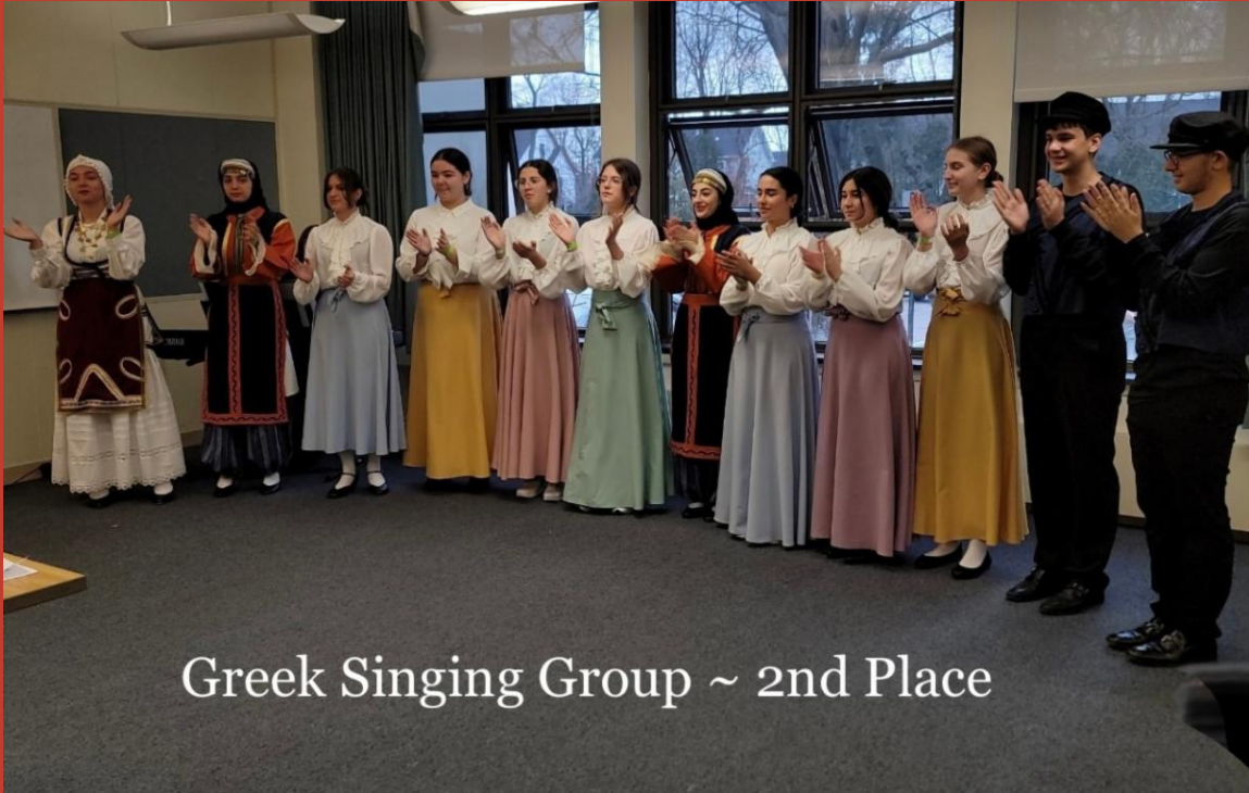
Greek Singing Group ~ 2nd Place