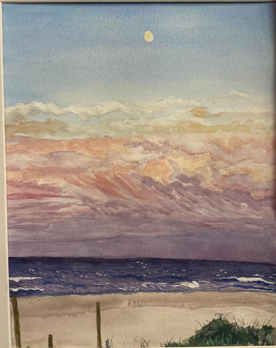
Sophia Lazarou ~ Watercolor