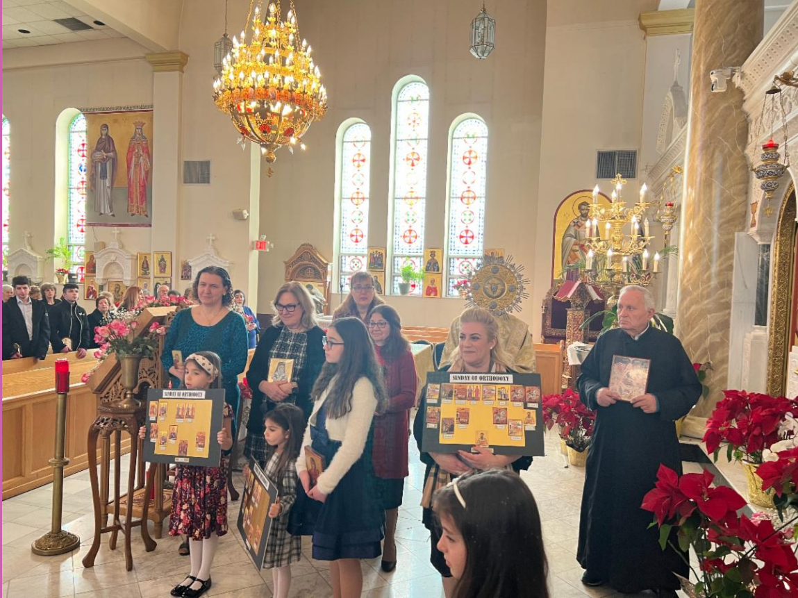
Sunday of Orthodoxy. Our catechism students prepared family trees with icons to commemorate the restoration of icons that adorn our church.