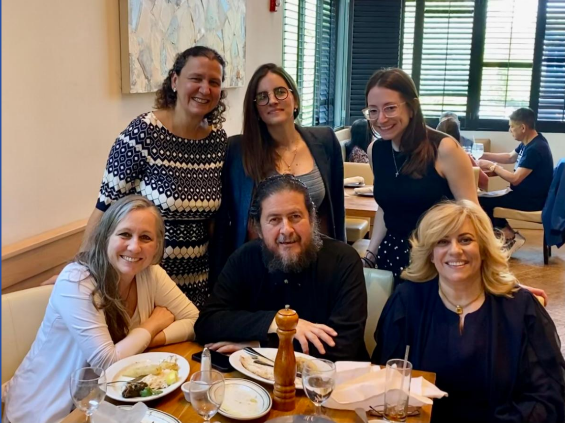
We are proud to recognize our Greek School and Catechism School Teachers during Teacher Appreciation Week