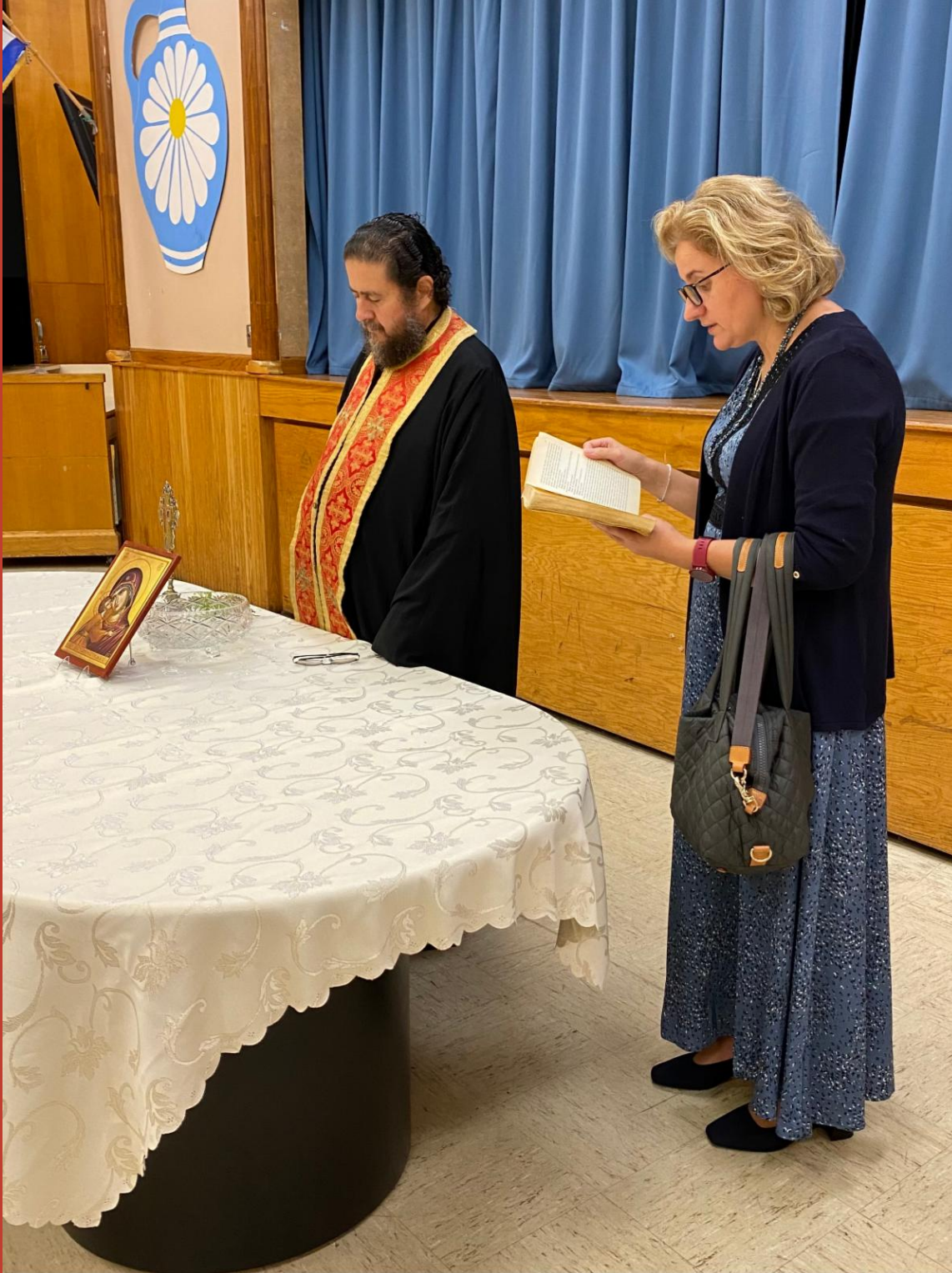
CELEBRATION of ALL SAINTS OF CYPRUS