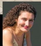
Stella Papatheodorou Soprano