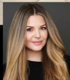
Olga Xanthopoulou Soprano