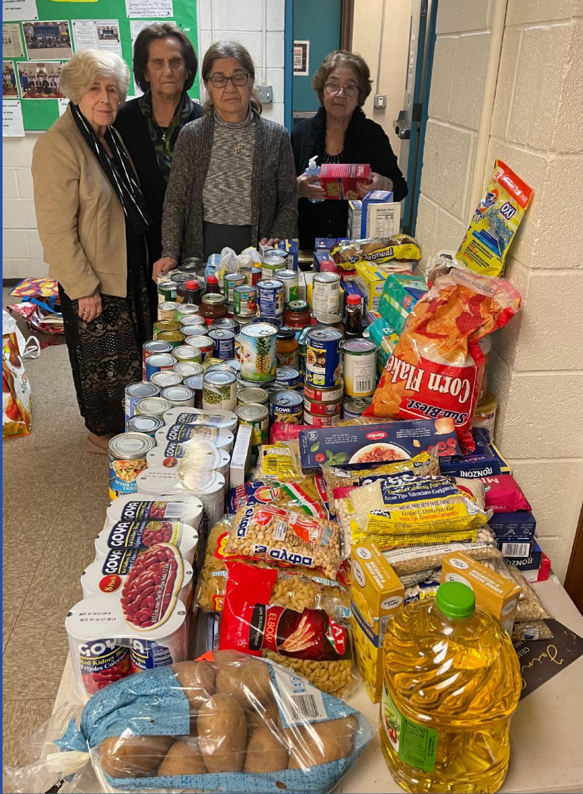
GOYA Bowling Party