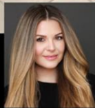
Olga Xanthopoulou Soprano