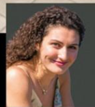
Stella Papatheodorou Soprano