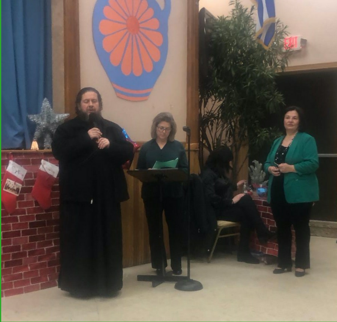
Pre- K, Kindergarten, First and Second Grades present the Nativity