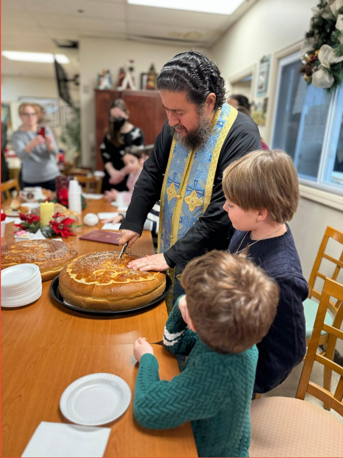
GOYA VISITS ST. NICHOLAS SHRINE