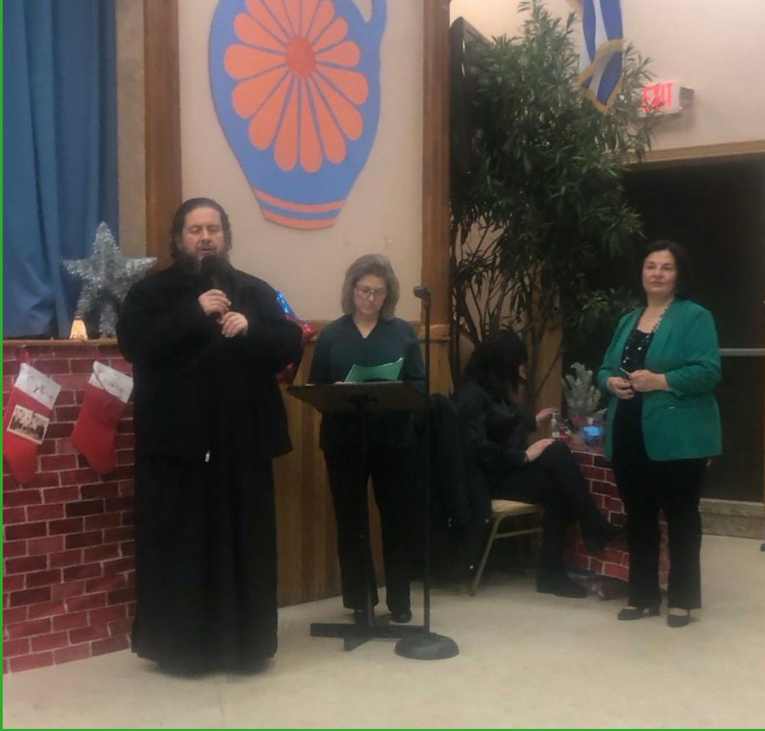
Pre- K, Kindergarten, First and Second Grades present the Nativity