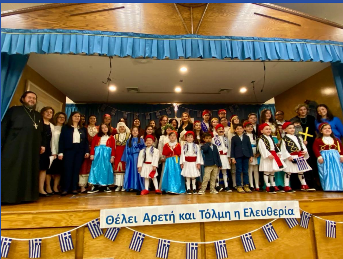
Κατάθεση στεφάνου στο Μνημείο του Αγνώστου Στρατιώτη στη σκηνή του Σχολείου .