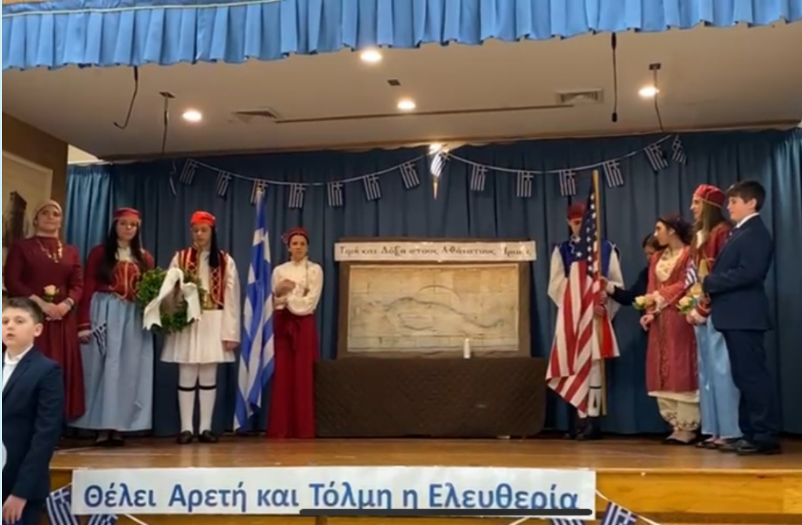
Τα παιδιά του Γυμνασίου του Ελληνικού μας Σχολείου (Την άλλη βδομάδα θα ακολουθήσουν και άλλες φωτογραφίες)