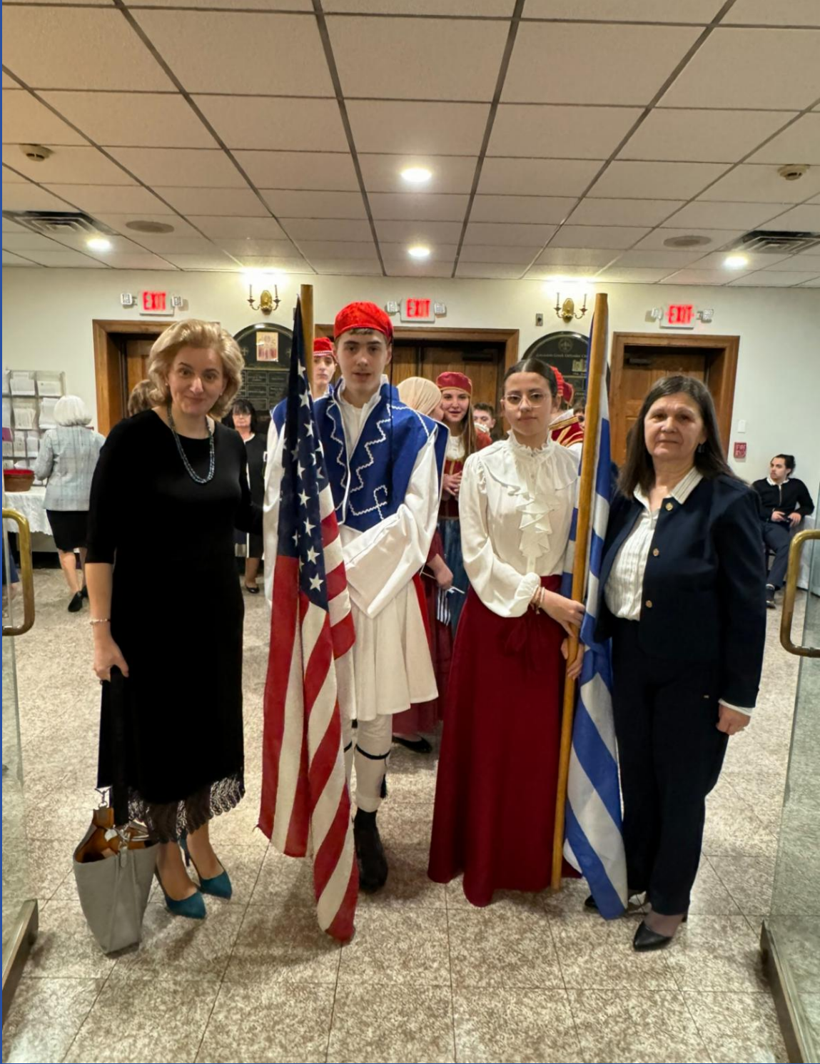
The Greek School students in Church