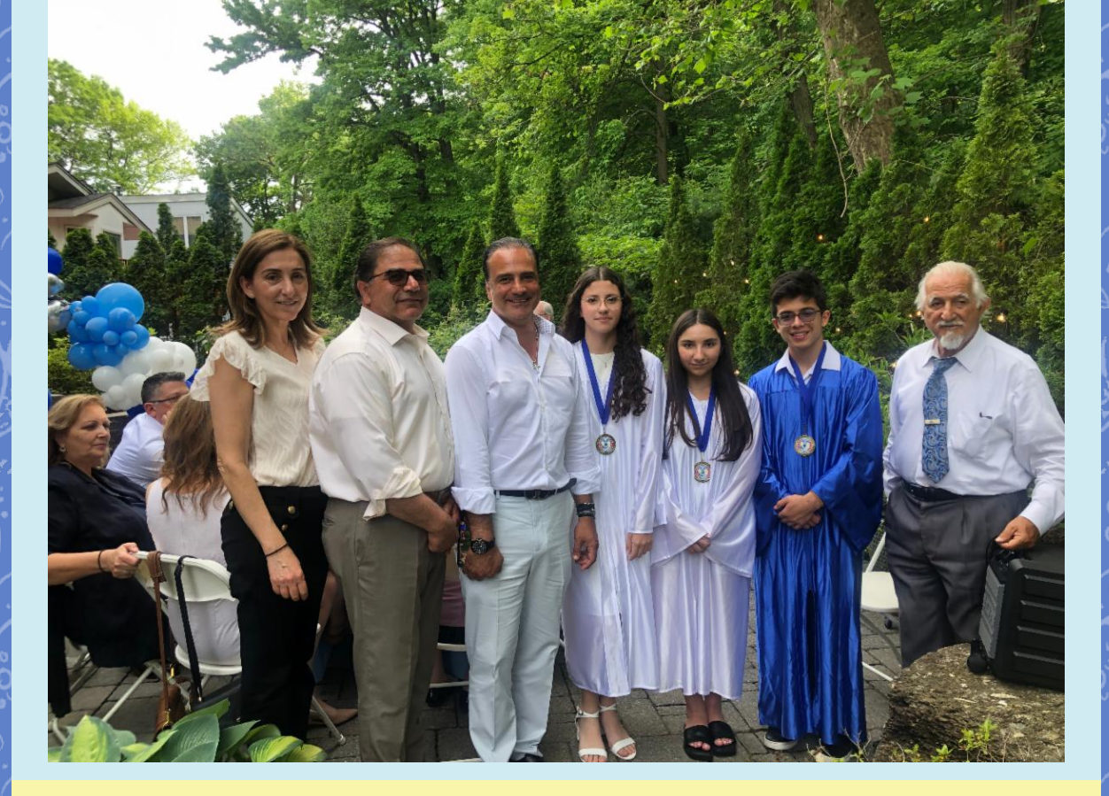
END-OF-THE-YEAR FRIENDSHIP & FELLOWSHIP